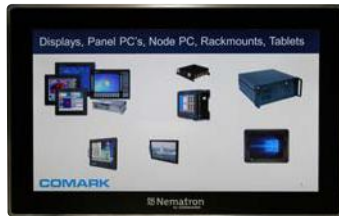
M1850WT - 18.5"