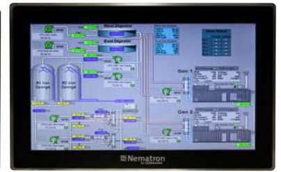
M2400WT - 24.0"