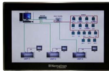
M2150WT - 21.5"