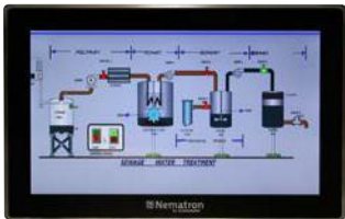
M1560WT - 15.6"